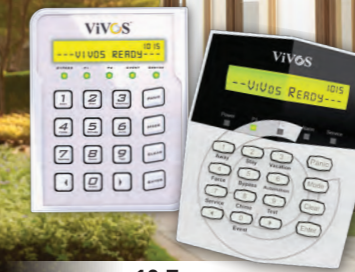
10-Zone Security System

SECURE & PROTECT your loved ones and belongings