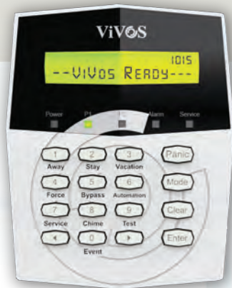
VG1 / VG6 10-Zone Security System