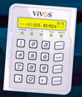
10-Zone Security System